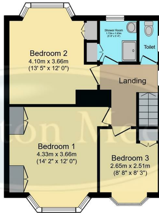
First Floor Floor area 47.0 m 2 (506 sq.ft.)